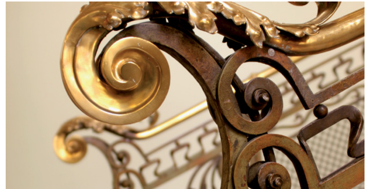
Detail of an Art Nouveau style balustrade