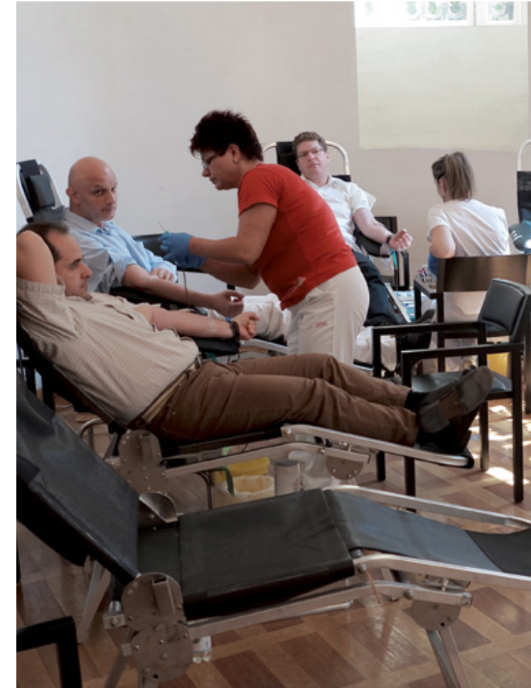
Voluntary blood donation in the Magyar Nemzeti Bank

These volunteering efforts complement the Magyar Nemzeti Bank's own charity activities. Volunteering consists of individual and group volunteering activities. Within the context of individual volunteering activities, employees participate in the volunteering programmes of appropriate and credible organisations recommended by the Magyar Nemzeti Bank based on their individual motives. Group volunteering – also incorporating team-building elements – takes place two to three times each year as part of environmental protection or settlement development schemes, focusing on the implementation of a specific project.