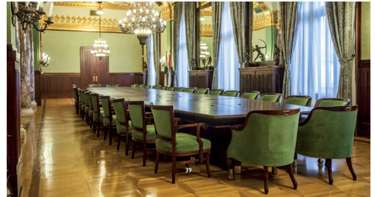
Lamfalussy Conference Room

Students in elementary and secondary education, as well as in university programmes other than economics, do not or only insufficiently receive the knowledge necessary for managing everyday finances. It is therefore important to launch financial awareness programmes at multiple levels, so as to ensure that the required information reaches the intended target audience.