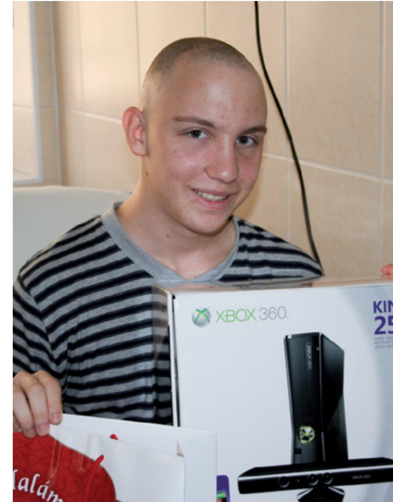
Wish fulfilled through the Magic Lamp Foundation

The Central European Neurosurgery Foundation was established in 2008 with the intention of developing child and adult neurosurgery within the Central European region by improving surgical equipment, offering training for professionals and funding for neurosurgery research.