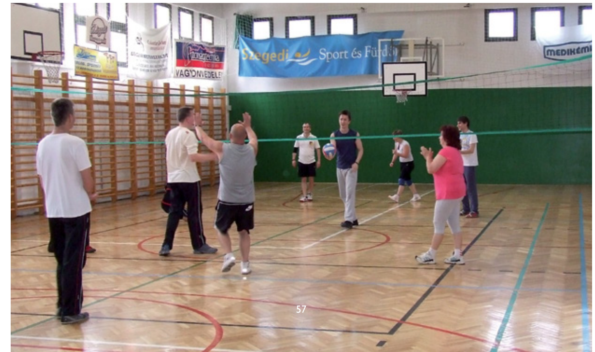
The Bank's employees can do sport in 17 sections