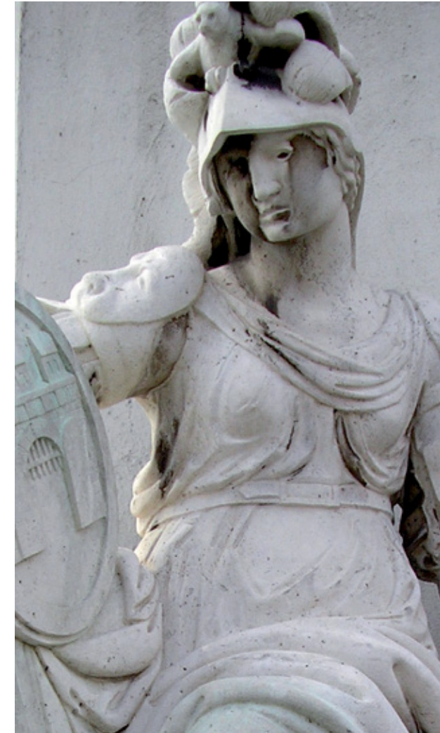
Statue of Pallas Athena decorating the MNB's building in Buda Castle

At the undergraduate level, Bachelor's programmes in general economics are intended to provide tomorrow's professionals with widespread knowledge in fields such as economic development, economic policy, legislation and enforcement, as well as sustainable development strategies. Upon completing a core curriculum of