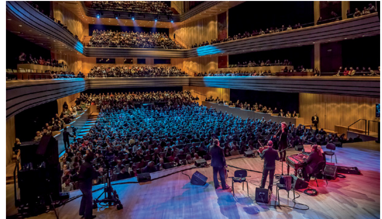
Sold-out show in the concert hall of the Palace of Arts

The International Eötvös Institute Foundation engages in the further training of young conductors and producers with the participation of world-renowned artists, and is also housed in the Budapest Music Centre's building.