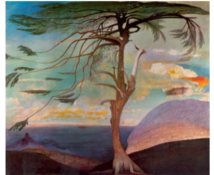
The Lonely Cedar, a painting by Tivadar Kosztka Csontváry; purchased by the MNB in 1994