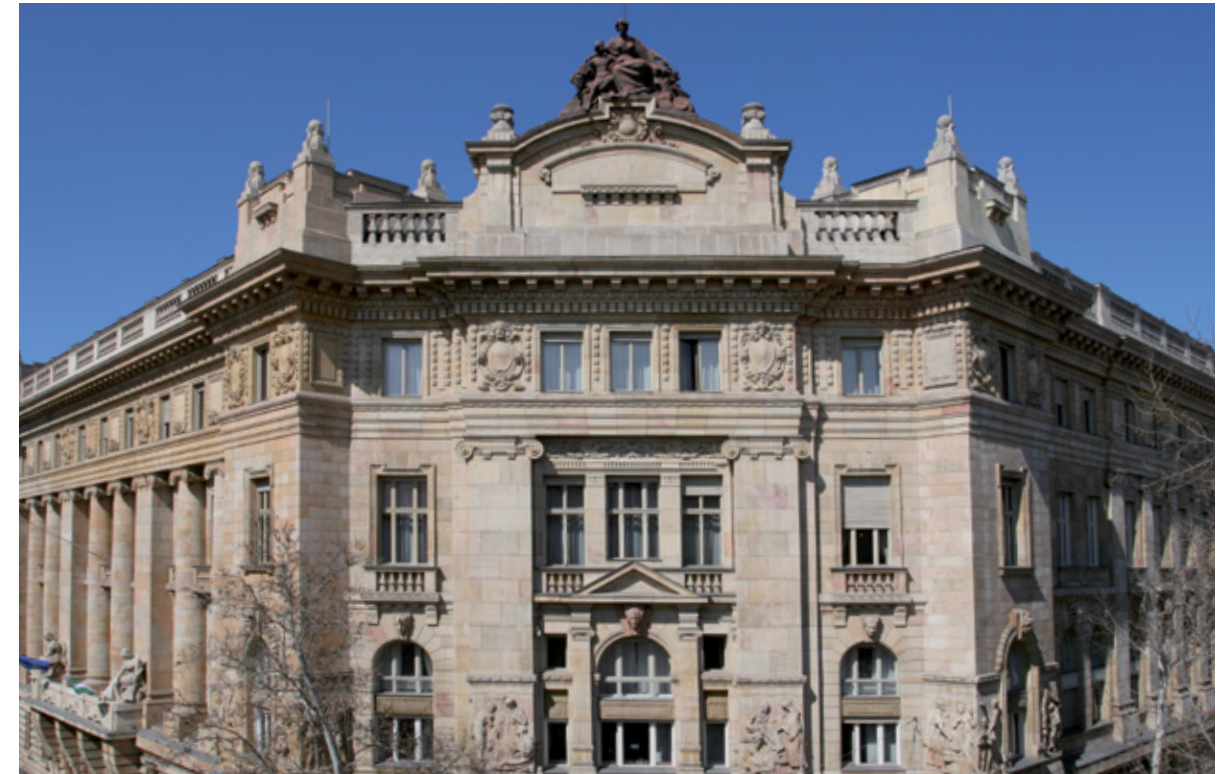
The Magyar Nemzeti Bank's building in Szabadság square

New central banking functions, expectations concerning independence and responsible control, as well as the practices of exemplary central banks call for new and institutional solutions in the field of CSR as well, thus necessitating a review of the Magyar Nemzeti Bank's objectives in its corporate social responsibility framework in order to be aligned with today's requirements.