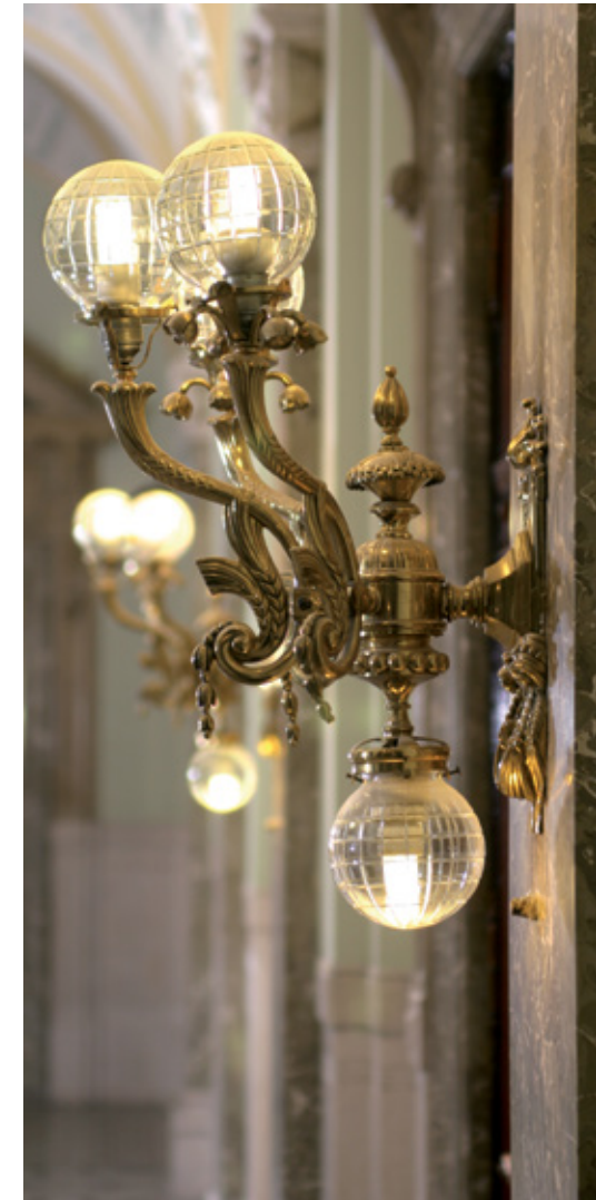
Lamp bracket with a wheatear motif