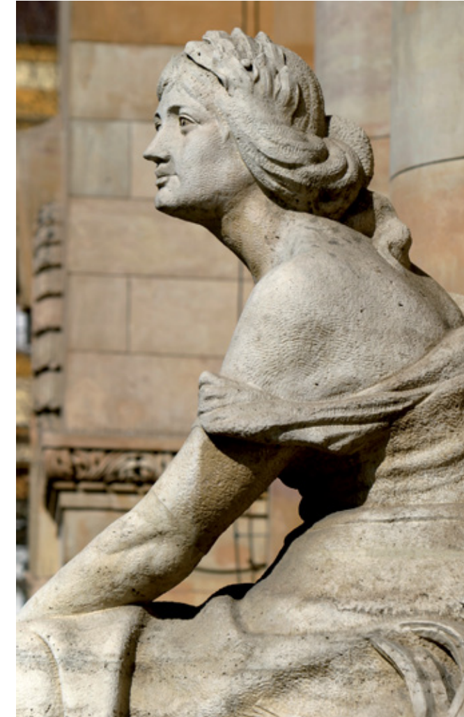
Statue above the main entrance by István Tóth