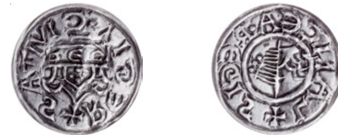
Lancea Regis – silver denar of King Saint Stephen

Besides the fact that operating a “museum of money” can be considered a general central banking practice, the Magyar Nemzeti Bank is required by law to have its collections of coins and notes on public display. However, a complete museum experience would call for having the history of money showcased in a wider context, by presenting the socio-economic framework of each era concerned, reflecting on European and regional processes and demonstrating today's events in currency history, with particular emphasis placed on the path towards the euro.