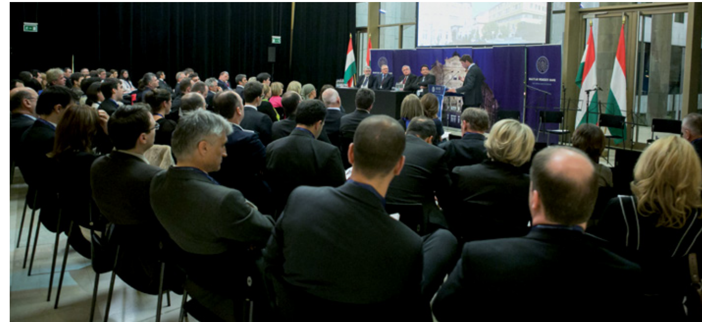
Lecture at an event organised by MNB Klub