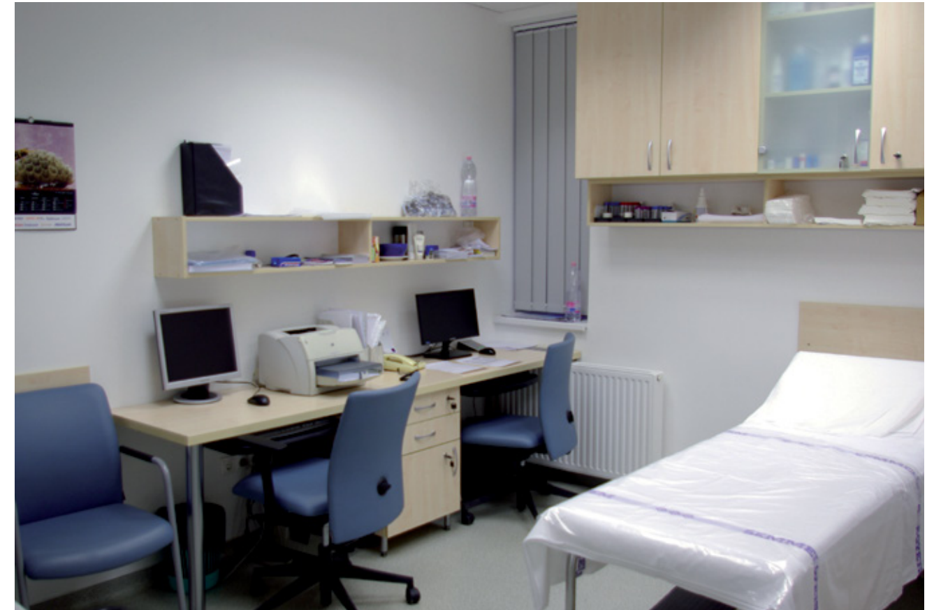
Department for Vascular and Cardiac Surgery

In addition to the above, the Bank is open to concluding further partnership agreements with both institutions and individual partners.