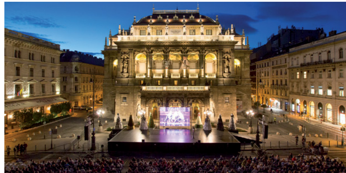
Budapest Opera House building

The association puts strong emphasis on representing both theory and practice, research and education, the public and the private sector, financial institutions and the media. The association has local organisations in every county across Hungary, and more than a dozen specialised divisions operating in Budapest with nationwide scope.