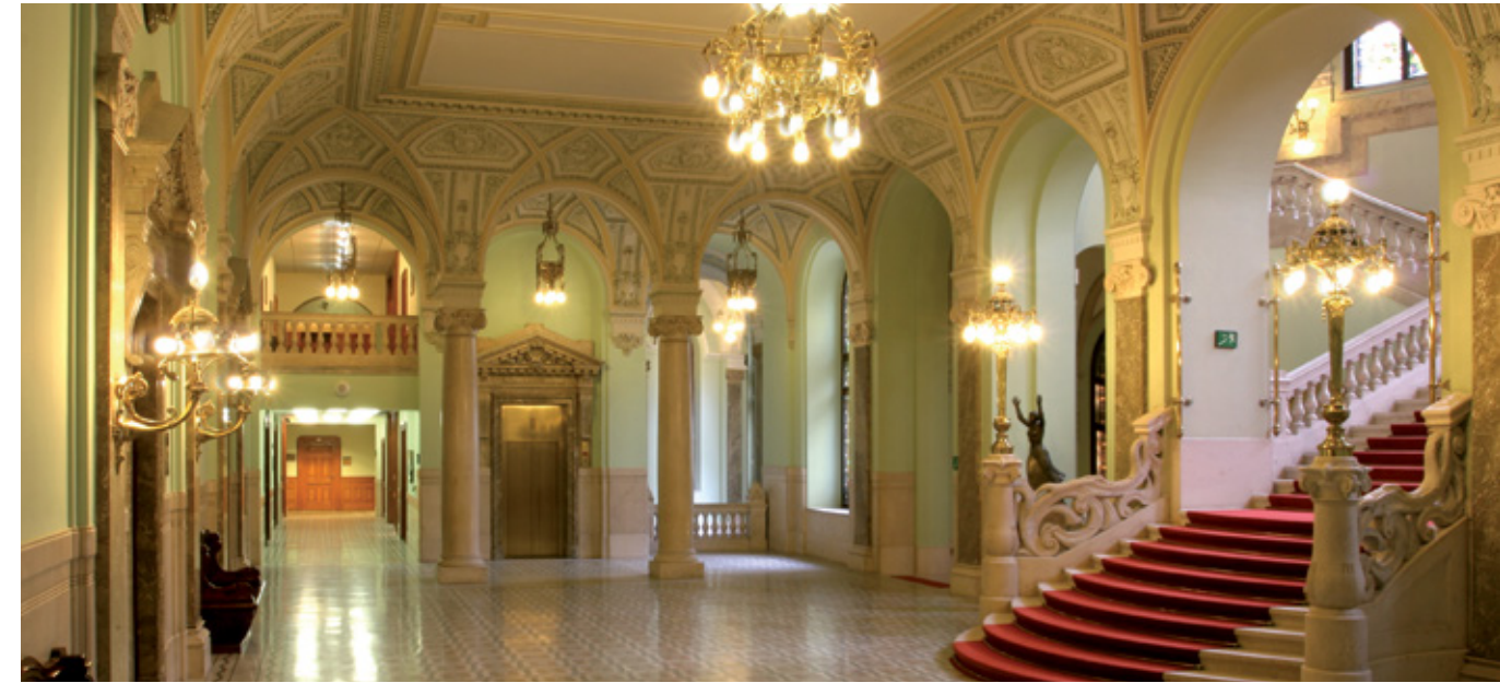
Entrance hall of the staircase on the first floor

It is a deliberate aim of the Magyar Nemzeti Bank to make the various elements of the Programme available to researchers with scientific degrees, PhD students, undergraduate and graduate students as well as colleges for advanced studies. In addition, through its lecture programmes, it also intends to bring fundamental financial and economic concepts closer to anyone interested, thereby enhancing financial literacy.