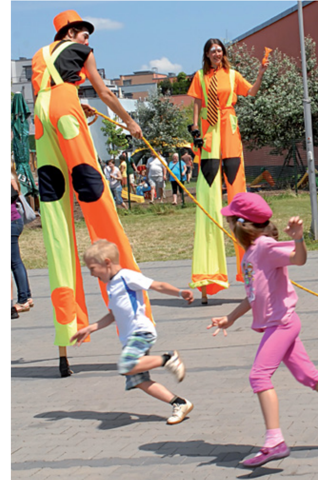
Family Day organised by the MNB