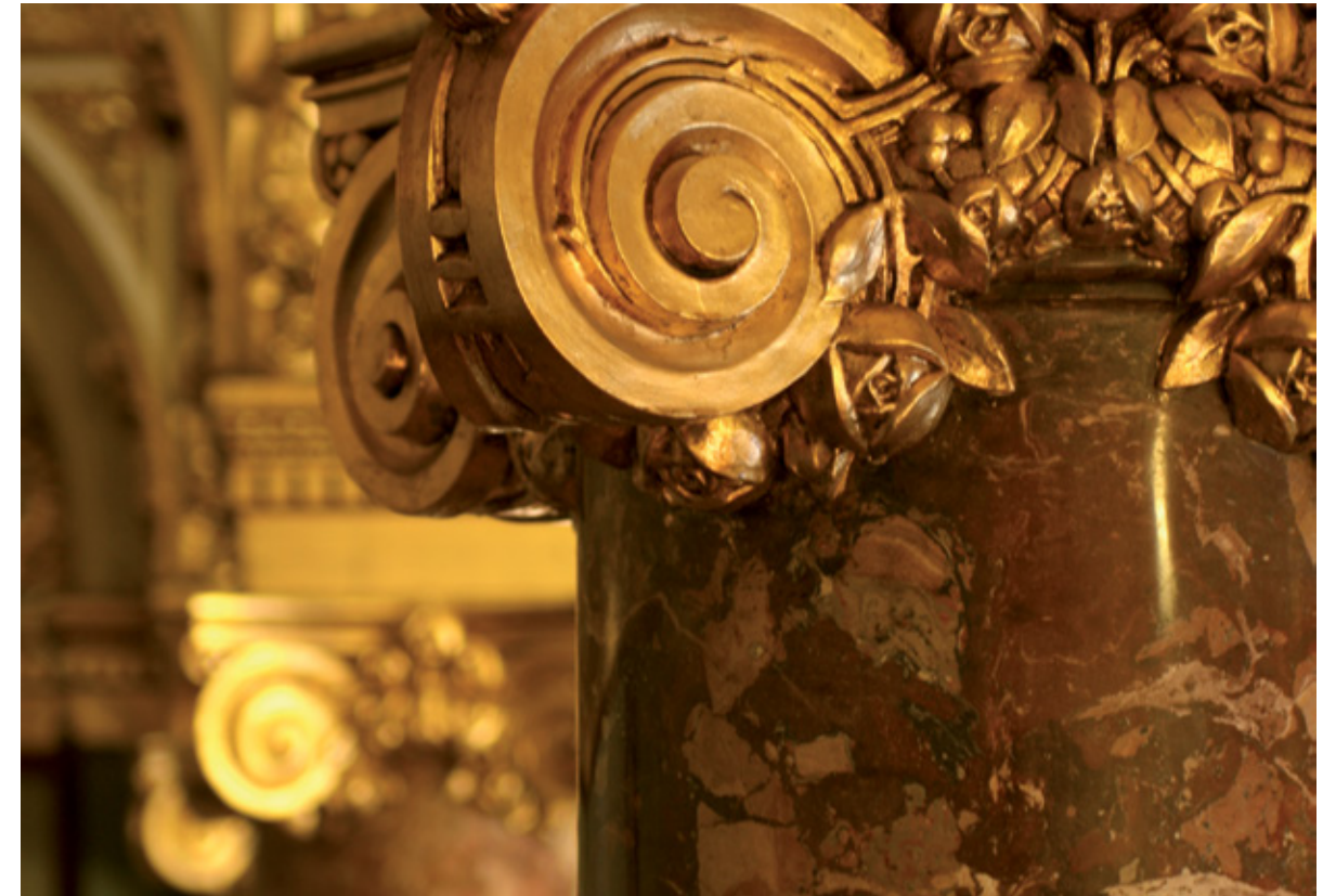
Gilded column head in Neo-Gothic style