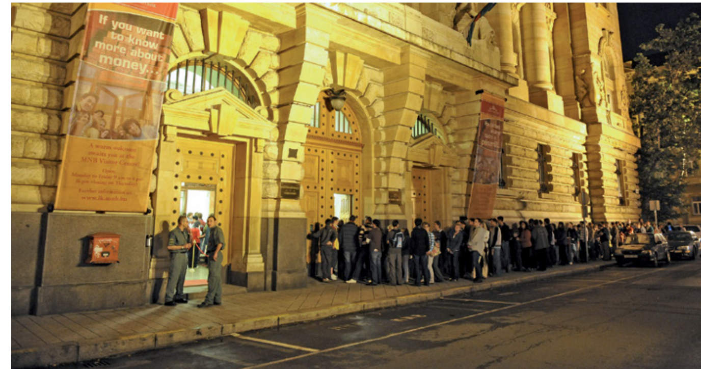
Night of Museums