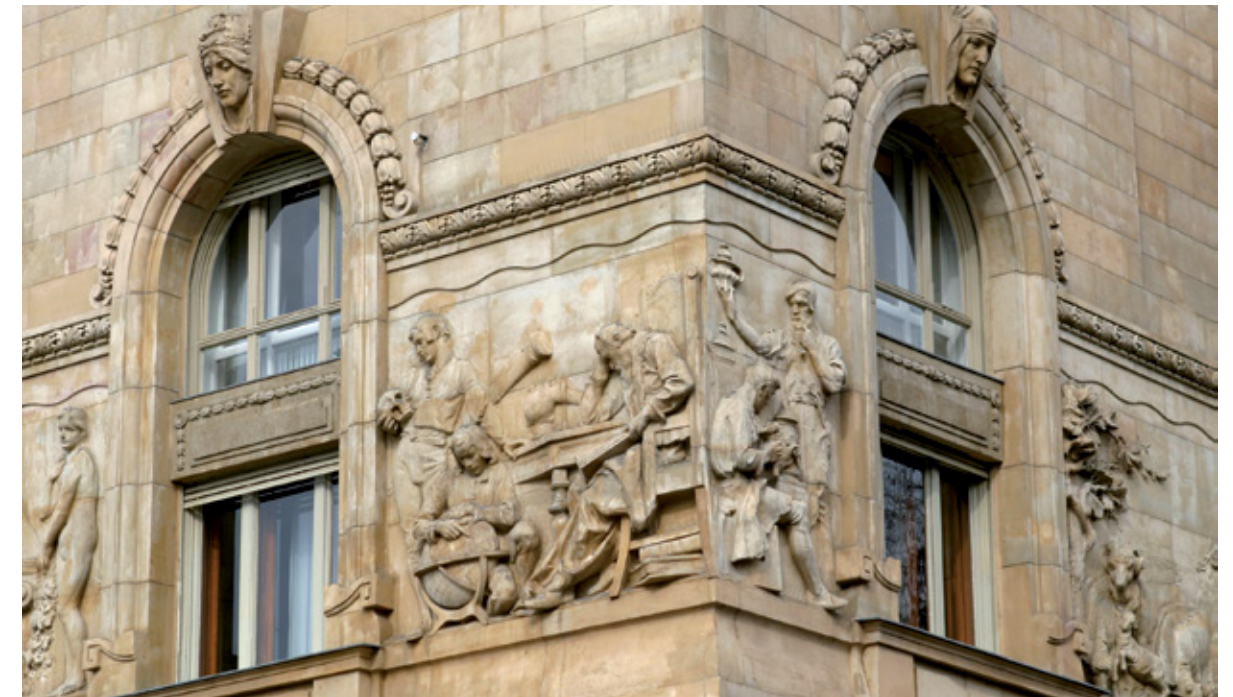
Reliefs by Károly Sennyey

All publications of the Magyar Nemzeti Bank are available on the website of the bank ( http://english.mnb.hu ).