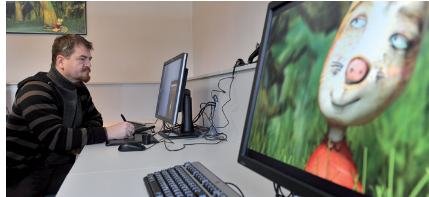
Animated cartoon made in the film studio at Kecskemét

The college was created to foster talent and provide further opportunities for education beyond the university. The college operates in symbiosis with Corvinus University, but as an independent, democratic organisation.